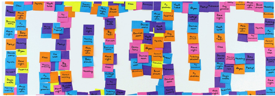
following God's vision

Our Mission is to be a joy-filled, Christ-centered community that is passionate about reaching our neighbors with Christ's radical love so that all our lives are changed!